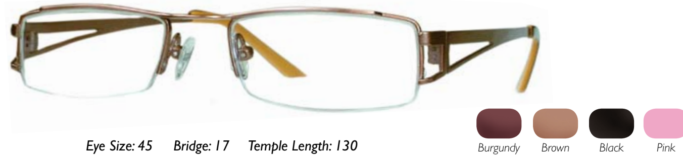
Eye Size: 45 Bridge: 17 Temple Length: 130