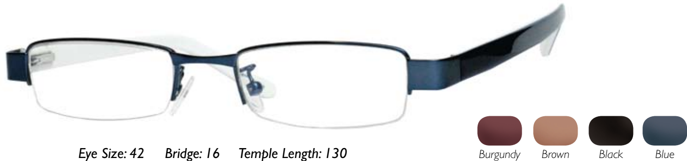
Eye Size: 42 Bridge: 16 Temple Length: 130