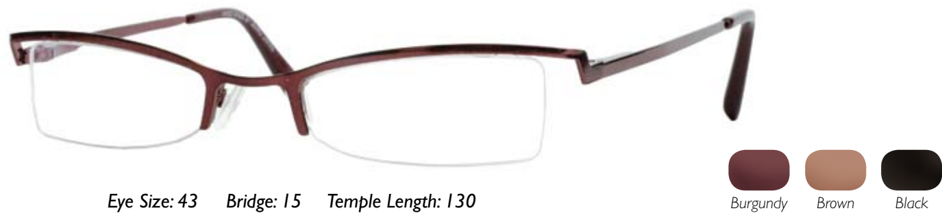
Eye Size: 43 Bridge: 15 Temple Length: 130