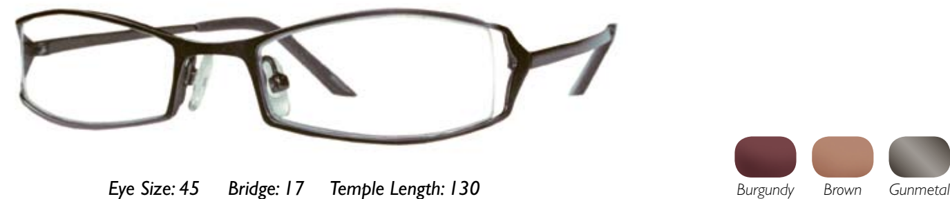
Eye Size: 45 Bridge: 17 Temple Length: 130