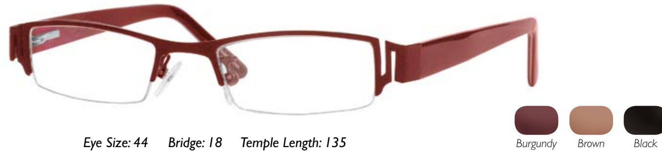
Eye Size: 44 Bridge: 18 Temple Length: 135