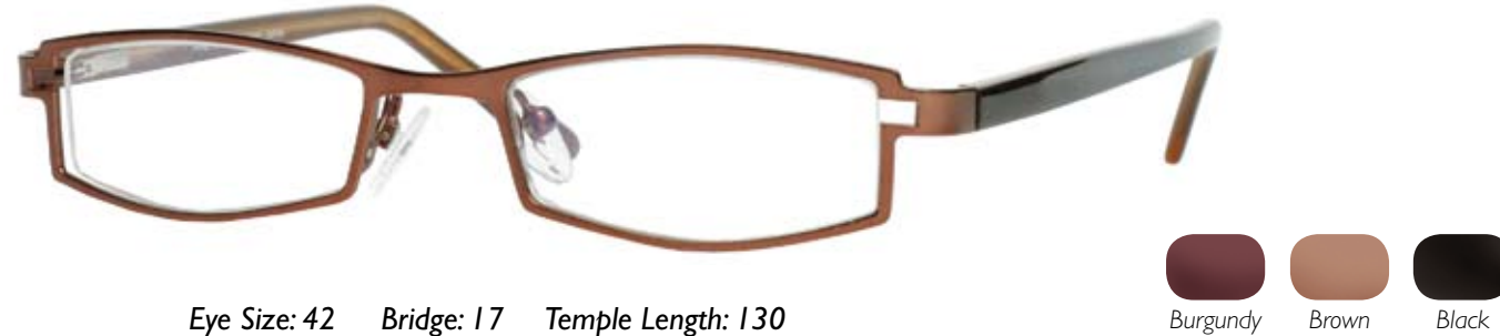
Eye Size: 42 Bridge: 17 Temple Length: 130